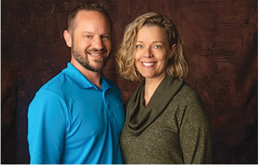
Owners of ServiceMaster of Marshalltown Celebrating 50 years - Thank you Marshalltown!!!